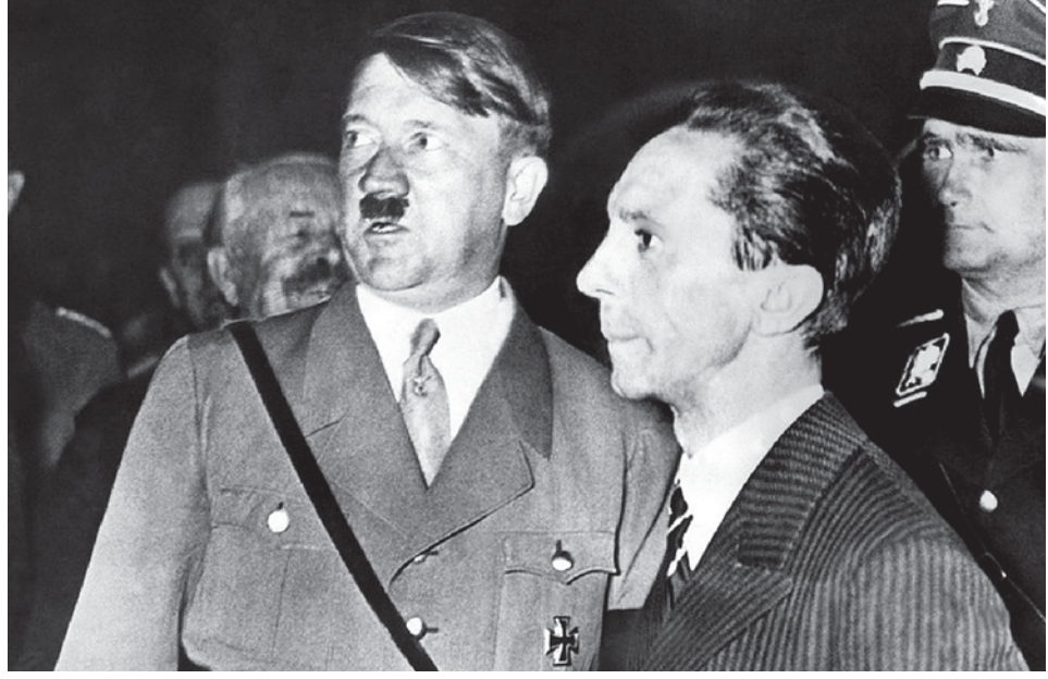
Adolf Hitler & Joseph Goebbels.

light quality as incandescent bulbs, use less energy, and are good for the planet—you are the victim of another evil EU force, the spirit of Goebbels.